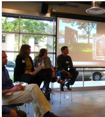
The event panelists discussed the history and future of development on Broadway.

Attendees heard a discussion about the history and future of development on Broadway, in addition to very positive feedback from both the local and non-local