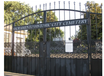
The City Cemetery features 28-acres of grounds, historic graves of many important historic figures, a variety of flower and plant

The volunteer-maintained rose garden features over 500 varieties of roses, many of which are not found elsewhere in the world. Botanist Fred Boutin started the garden only 20 years ago, but many of the roses now in the garden were propagated from plants dating back as far as the Gold Rush.