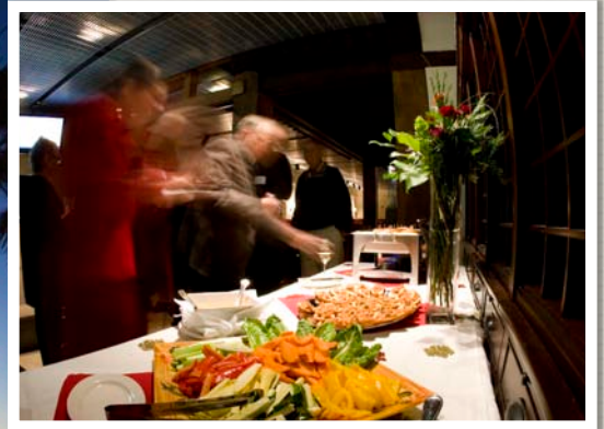
2ND ANNUAL DECEMBER HOLIDAY RECEPTION @ IRON STEAKS RESTAURANT ON BROADWAY