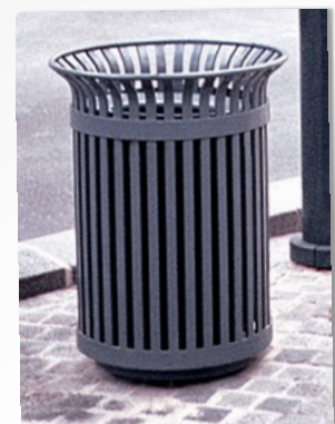
KEEPING IT CLEAN