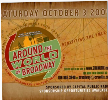
AROUND THE WORLD

Promotion--Around the World on Broadway, In the Flow Jazz Festival, "Broadway Uncovered" directory.